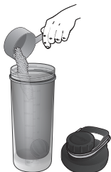
Pour in the powder

To use, insert your ingredients into the bottle with the shaker ball and shake according to drink manufacturer instructions. Make sure the lid is screwed on tightly before shaking.