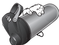
Ready to drink